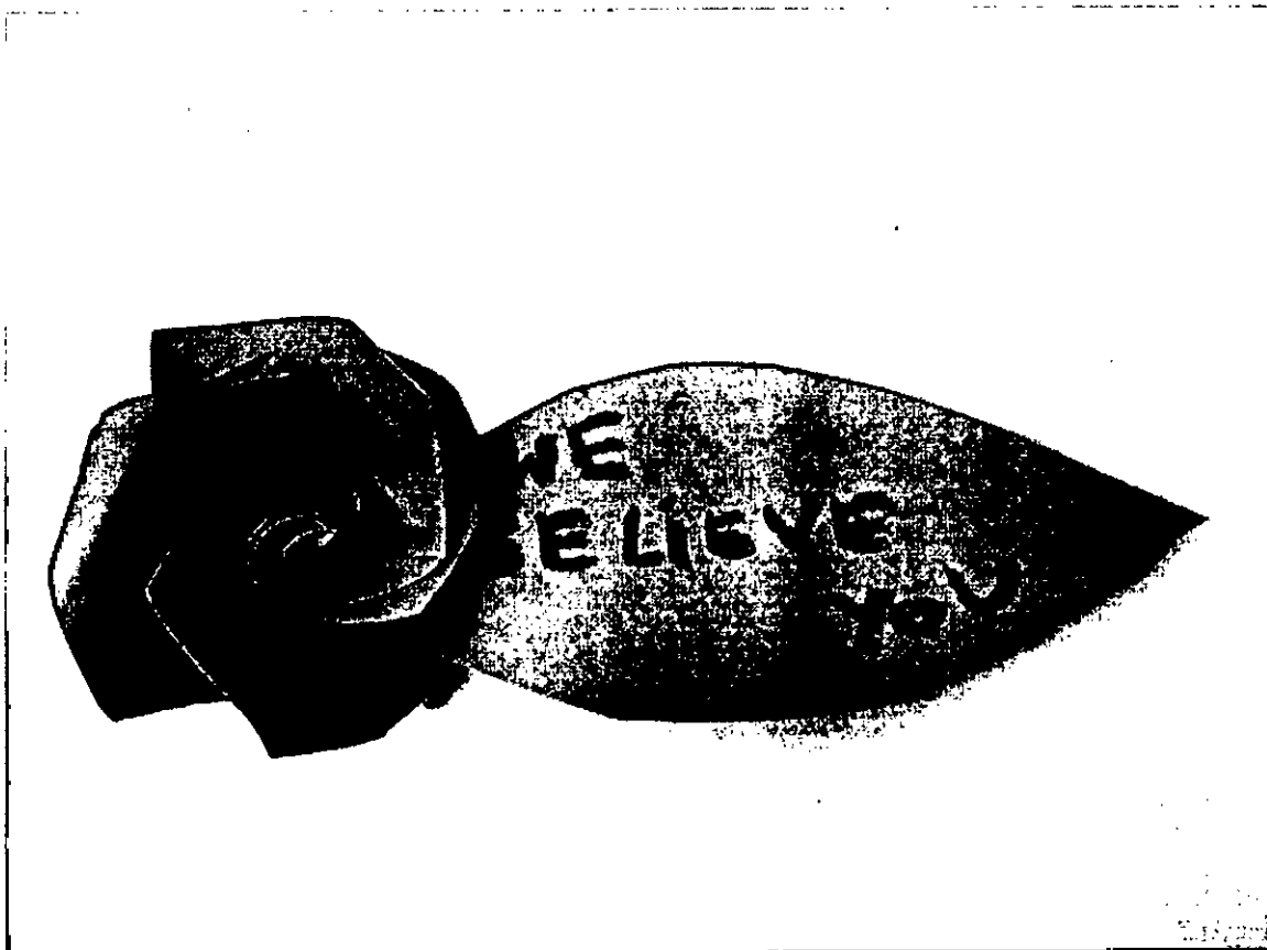
One of the flowers made by CRCC volunteers as part of 'Remembering Srebrenica' 2019

Report of the Trustees Year Ended 31 March 2019 for Cambridge Rape Crisis Centre